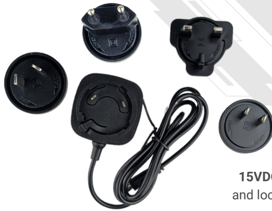
15VDC Charger and local adapters