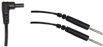
2.35mm Electrode Cord